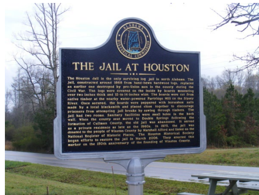
AHC Historical Marker (Large 30”h x 42”w)