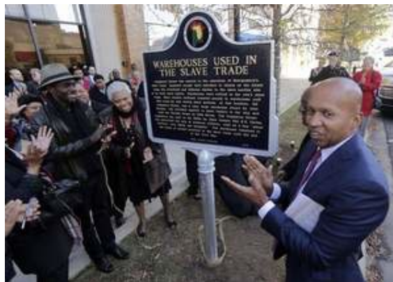
BHC Marker (Large 30”h x 42”w)