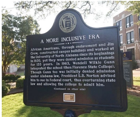
Marker with QR Code