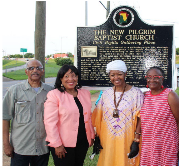
Marker with Photograph (Large 30”h x 42”w)